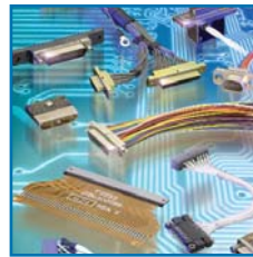
Microdot Connectors and Cables