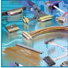
Microdot Connectors and Cables