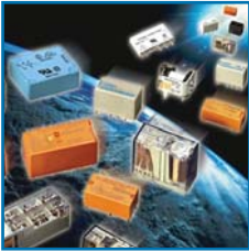
Schrack PCB Relays