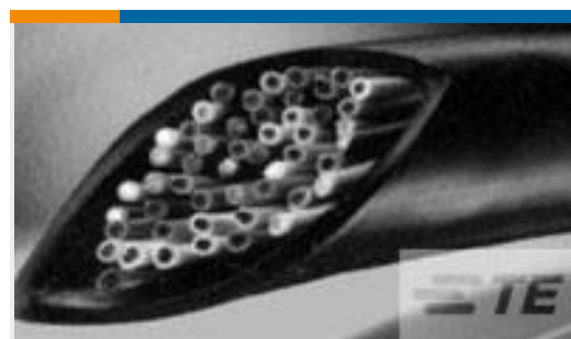
TE Part #6032624002 NTFR-2-0-SP