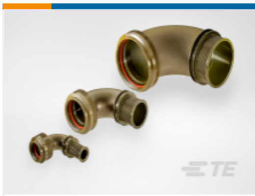
TE Part # AAF1140-00 BTH3-09-04-1-C-SE