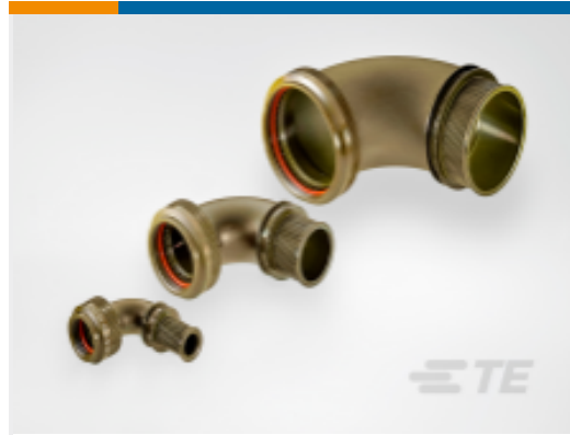
TE Part # AAF1145-00 BTH3-15-09-1-C-SE