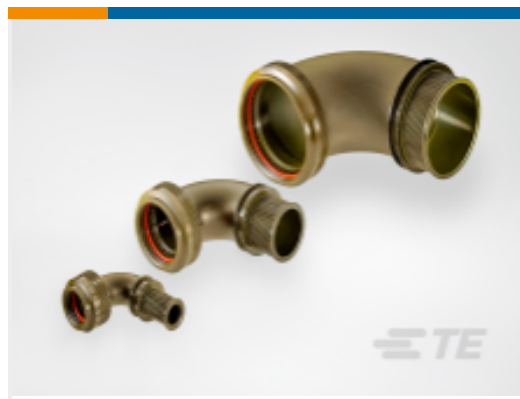
TE Part # AAF1141-00 BTH3-11-05-1-C-SE