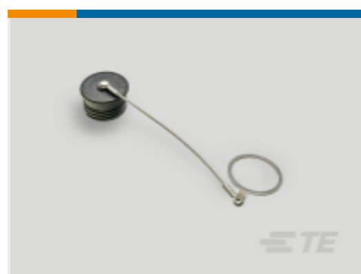
TE Part #YDTS32F13NV0010000 DUST COVER ASSEM