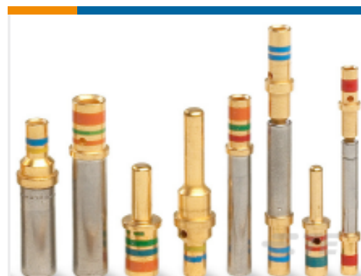
TE Part #38941-16 CONTACTS