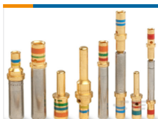
TE Part #38943-12L CONTACT T12 FEMELLE (= 724-0007-12)