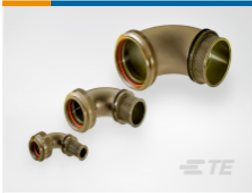
TE Part # AAF1144-00 BTH3-13-08-1-C-SE