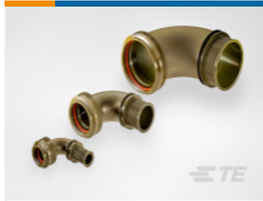
TE Part # AAF4208-00 BTH3-15-10-1-B-SE