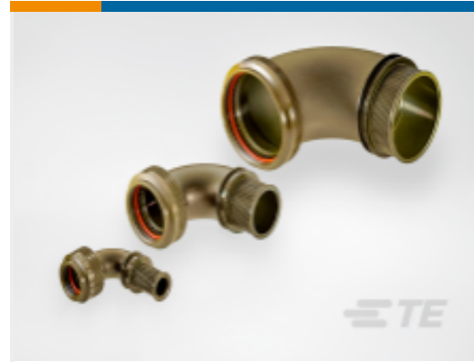
TE Part # AAF1146-00 BTH3-15-10-1-C-SE