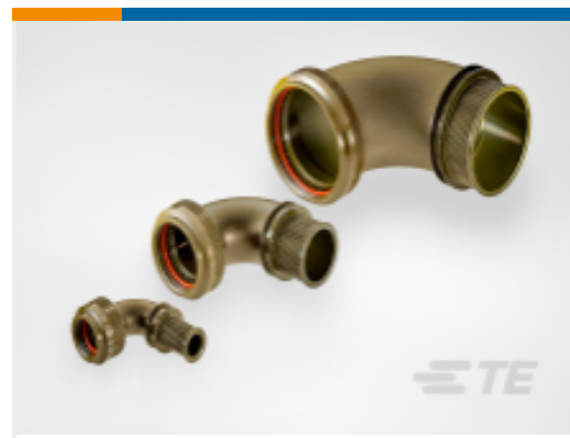
TE Part # AAF1143-00 BTH3-13-07-1-C-SE