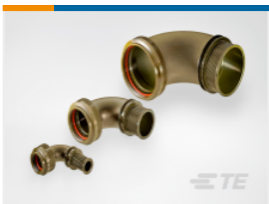
TE Part # AAF2404-00 BTH3-09-04-1-B-SE