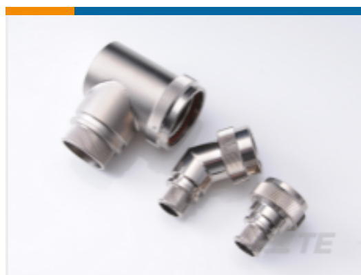
TE Part # CAT-R85049-1E M85049/83 Unscreened, Banding Backshells