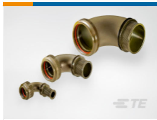
TE Part # AAF1142-00 BTH3-11-06-1-C-SE