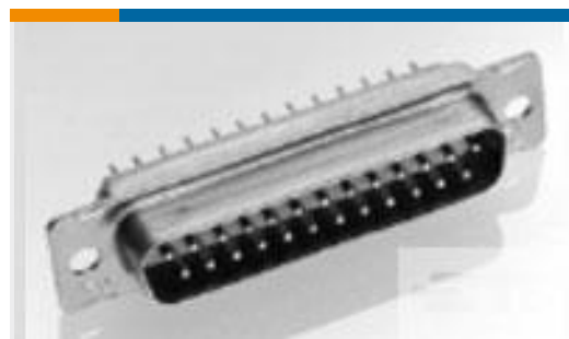
TE Part #204514-2 RECEIPT ASSY,26 POSN,AMPLIMITE