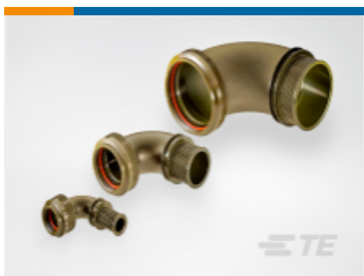
TE Part # AAF1139-00 BTH3-09-03-1-C-SE