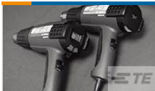
TE Part # CJ2087-000 HL2010E-KIT-120V