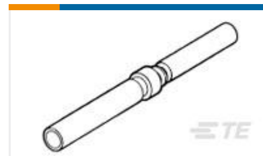
TE Part #204351-1 SZ 22 SOCKET CONTACT