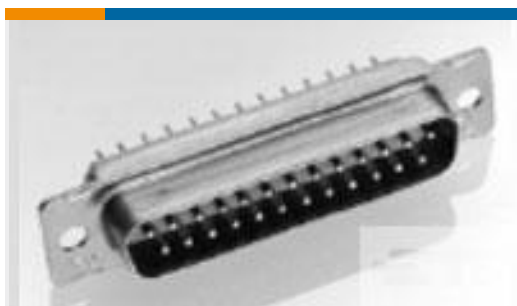
TE Part #1757819-8 AMPLIMITE,ASY,PLUG,STD,109,ZN,3,CT