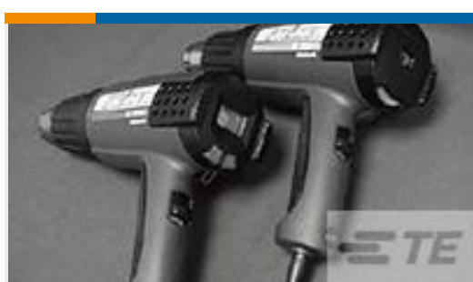
TE Part # CJ2087-000 HL2010E-KIT-120V