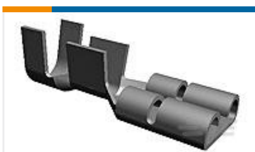
TE Part #100570-2 250 FASTON,REC.,14-17AWG,TPBR