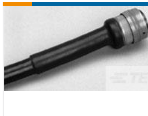
TE Part #3000814006 ATUM-6/2-X-SP