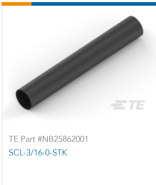
TE Part #NB25862001 SCL-3/16-0-STK