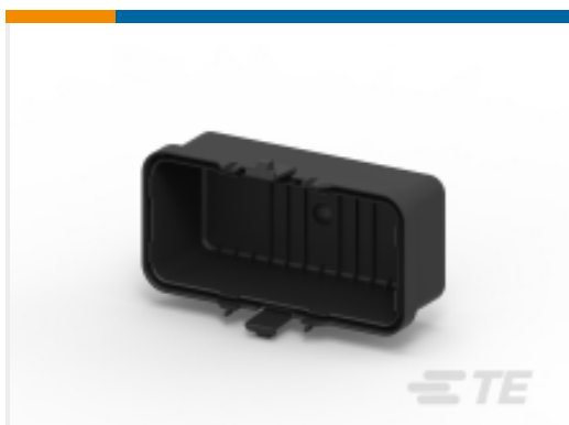
TE Part #1443996-4 COVER, 60 POS, W/O FUSE HLDR/NO EXT TEXT