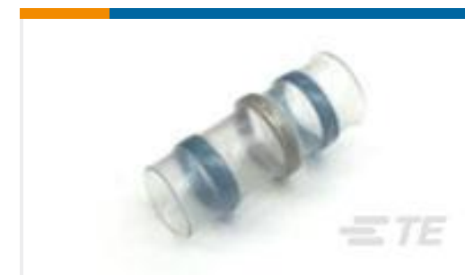
TE Part #054955-000 CWT-9001