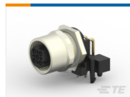
TE Part #T4145535041-002 M12 R/A F PNLREAR D-CODE 4P PCBSTD SHLD