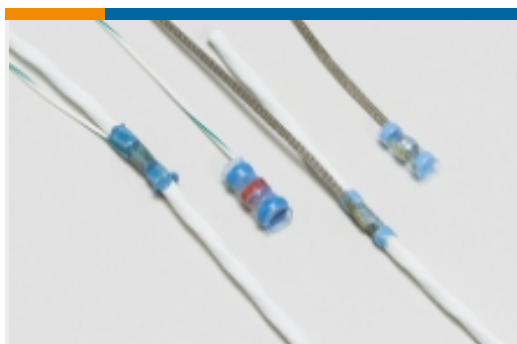
SolderSleeve Shield Terminators(27)