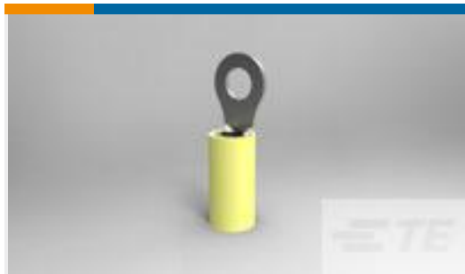
TE Part #2-36161-4 TERMINAL,PIDG R IR 10 10