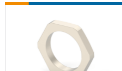
TE Part #2823066-1 M16 NUT-M12 FRONT PANEL MOUNT CONNECTORS