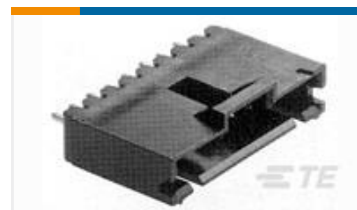
TE Part #104362-7 08 MTE HDR SRST LATCH W/HLDWN