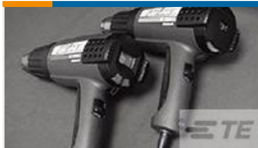
TE Part # CJ2087-000 HL2010E-KIT-120V