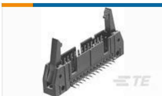
TE Part #3-5499345-0 A/L UNIV HDR 50P RA SHT LAT BLUE