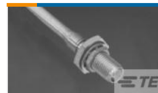
TE Part #1051984-1 SMA BULKHEAD JACK 2034 8009 90