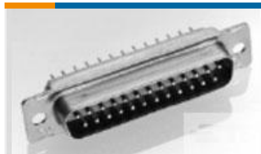
TE Part #1757824-9 AMPLIMITE,ASY,RCPT,STD,90,ZN,3,CT