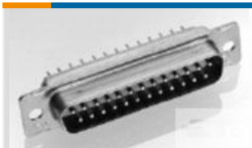
TE Part #205564-2 AMPLIMITE,ASY,PLUG,STD,109,5