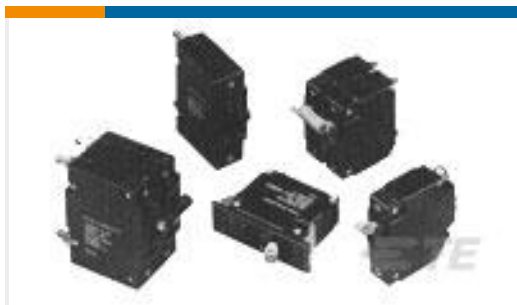
TE Part #1393255-8 W93-X112-30=M6/M7/M9/W6/W7