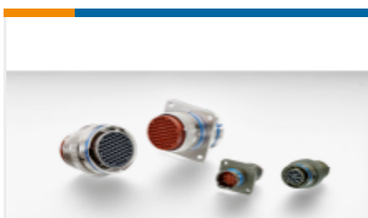
TE Part #YAFD56-22-55PNC012 PLUG ASSY