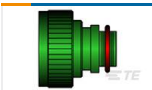
TE Part #105217-000 TXR54AB00-0804BI