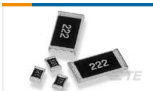
TE Part #1622829-1 CRG0603 1% 10K