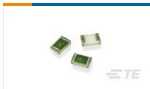
TE Part #1676354-3 RN 0805 4K02 0.1% 10PPM 5KRL