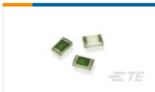
TE Part #1676283-2 RN 0805 2K15 0.1% 10PPM 1KRL