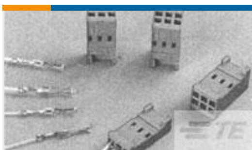
TE Part #182734-2 CONTACT REC HE14 COSI LOOSE P