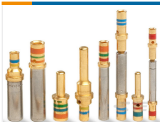
TE Part #2560-215-1631L CONT PIN