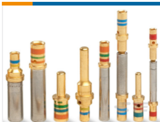
TE Part #2560-218-2031 CONT PIN