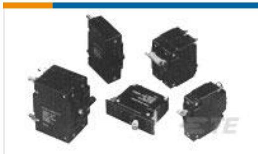
TE Part #2-1393254-1 W91-X112-1=M6/M7/M9/W6/W7