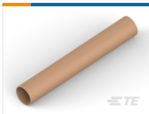
TE Part #5356510001 SAS-160-1-1030-0