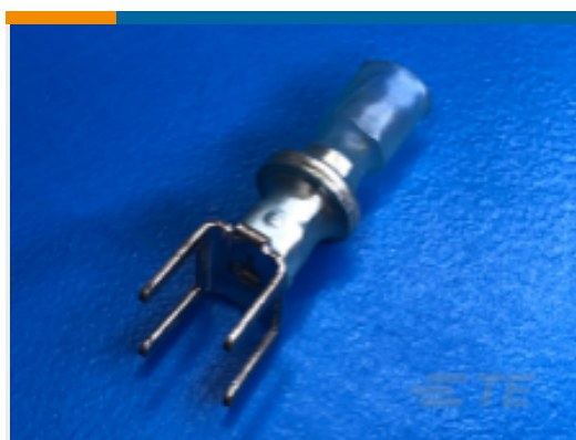
TE Part #327534-000 D-607-20