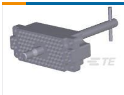
TE Part #201692-9 CNTR FASTENER PLUG BLOCK,104P