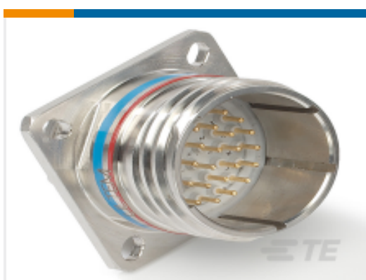
TE Part # CAT-D38999-DTS2P D38999: Square Flange, 09-35 insert