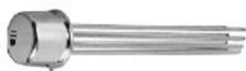
TE Part #1617119-5 J1MAW-18XP = M39016/7-021P