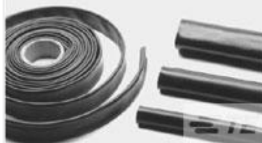
TE Part #CS8624-000 BSTS-15X4FR/NM