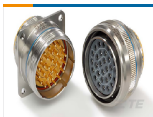
TE Part #ZPF000000000007174 983-ORS 08-98 PN