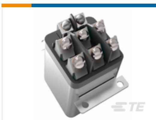
TE Part #1617807-5 FC-335-SY8= RELAY, 3PST