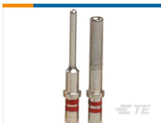
TE Part #ZPF00000000001261 097-0267-16 A1267