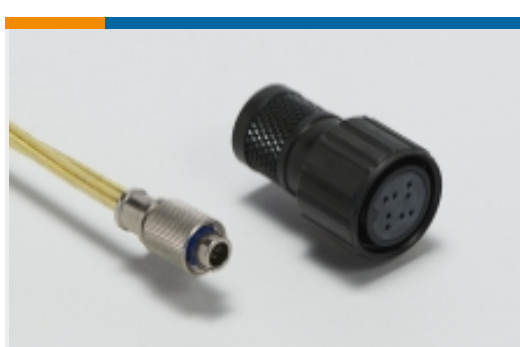
Standard Circular Connectors(50985)