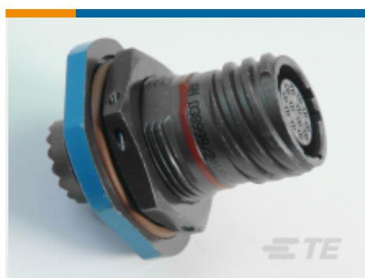
TE Part # CAT-D38999-DTS111 D38999: Jam Nut, 09-35 Insert