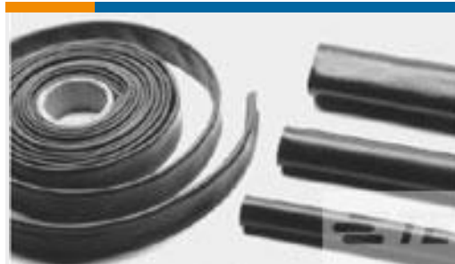
TE Part #CX1369-000 BSTS-13X4FR/NM