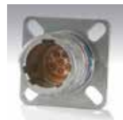
Square Flange Receptacle