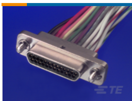
TE Part #1532174-4 M83513/04-D04N, MCKS-N1-B-25S6G9-36.0