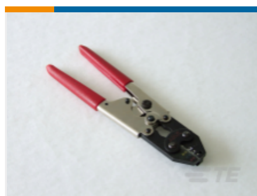
TE Part # 992008-000 AD-1377-CRIMP-TOOL-3-CVTY