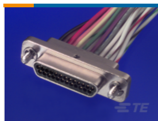
TE Part #1532184-4 M83513/03-F04N, MCKS-N1-B-37P6G9-36.0