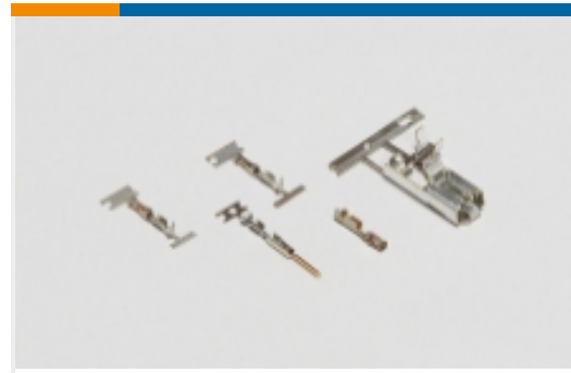
Wire-to-Board Connector Contacts(1)