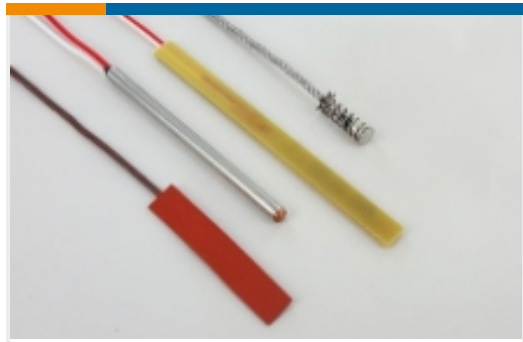
RTD Probes & Assemblies(2)