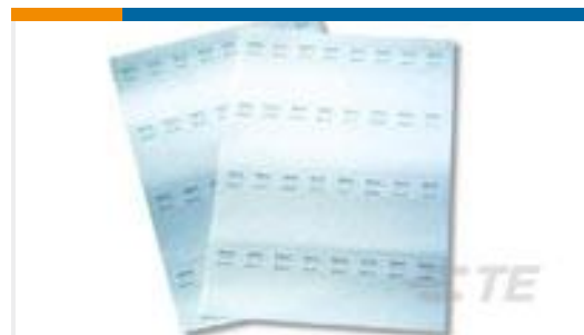
TE Part #260206-000 CR-108-LSR