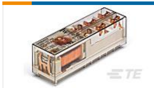
TE Part #6-1415537-5 SR6A6K24