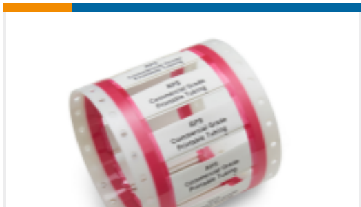
TE Part #A32214-000 RPS COMMERCIAL GRADE SLEEVES