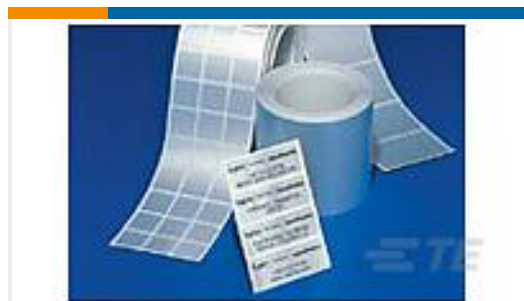
TE Part #E44791-000 MP-762508-2.5-8A