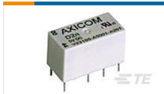
TE Part #1393793-3 V23105A5307A201