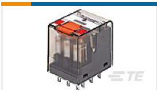
TE Part #9-1419111-4 PT571048