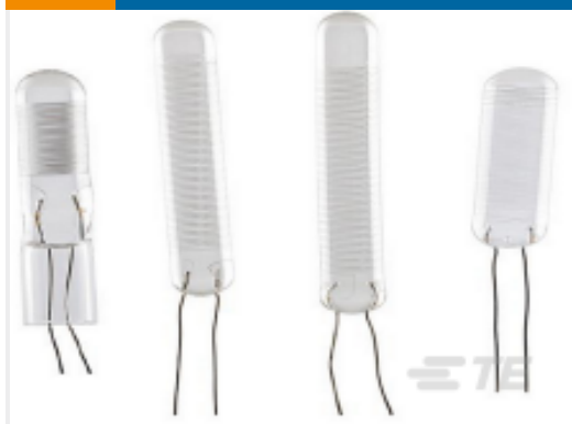
TE Part #SB0864 GO1545 1Pt100 W0.1 L15 /D4.5mm