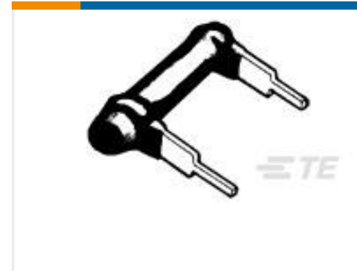
TE Part #1-1623713-0 FCB2 22R 5% HP