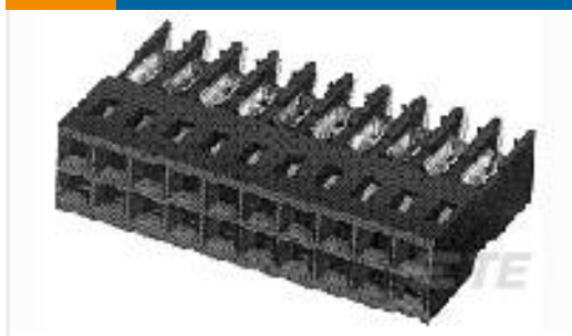
TE Part #102393-5 14 AMPMODU MT ASSY DR .100CL