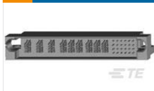
TE Part #2-6450332-3 MBXL R/A HDR 3ACP+6P+24S