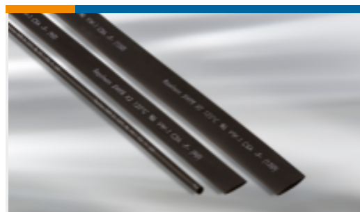
TE Part #EM7507-000 X4-6.0-0-SP-SM