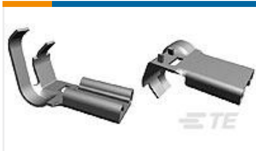
TE Part #63517-1 250 FLG FAST REC 18-12 TPBR