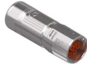
Contact Arrangement mating view

H 51 A 008 NN 00 42 0100 000 H S A 008 N 00 42 0100 000