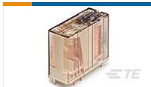
TE Part #1-1415012-1 V23047-A1110-A501