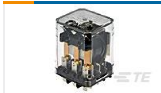
TE Part #3-1393118-1 KUP-14D45-110=KU