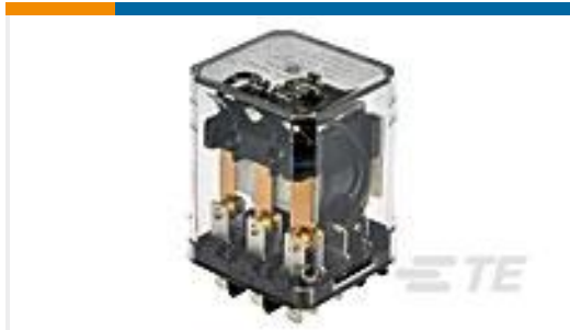
TE Part #2-1393118-6 KUP-14D35-110=KU