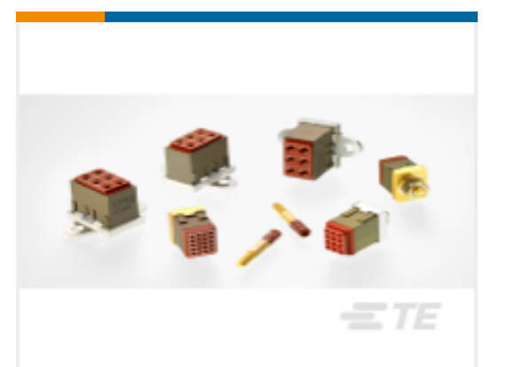
TE Part #CTJ720K01B-7067 MODULE ASSY