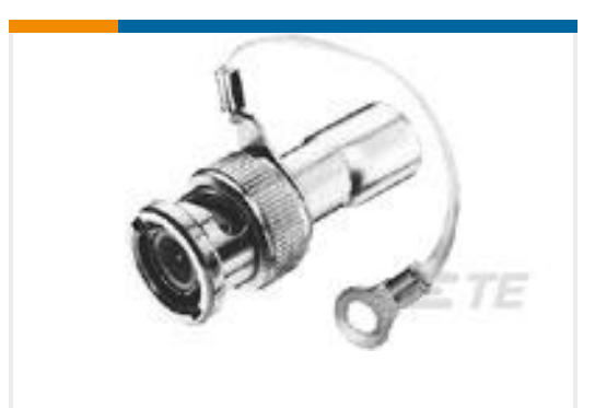
TE Part #221629-2 TERMINATOR,BNC,75 OHM,1 WATT