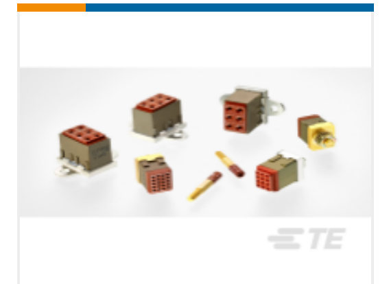
TE Part #CTJ720E01B-7067 MODULE ASSY