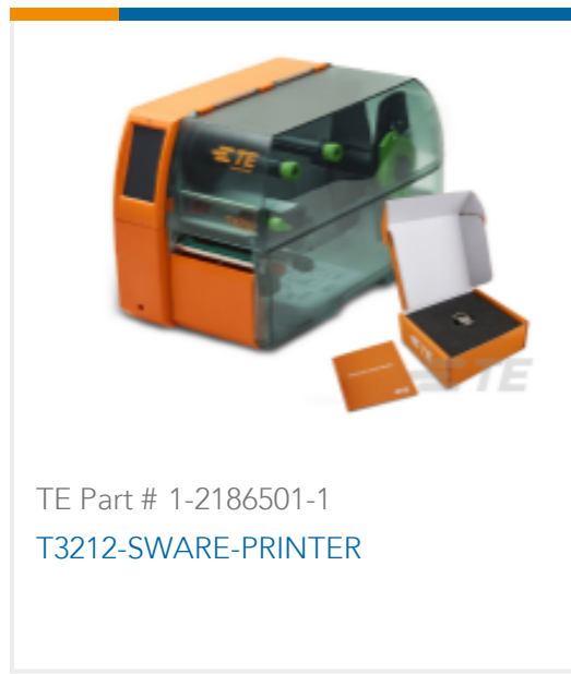
TE Part # 1-2186501-1 T3212-SWARE-PRINTER