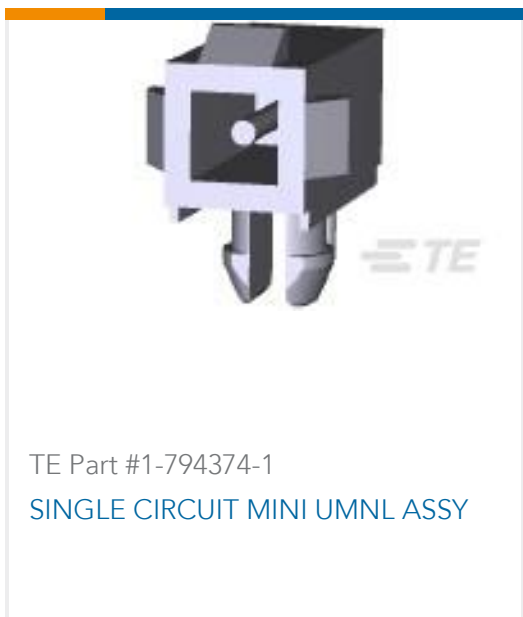
TE Part #1-794374-1 SINGLE CIRCUIT MINI UMNL ASSY