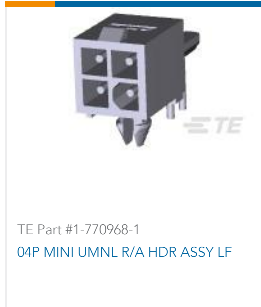
TE Part #1-770968-1 04P MINI UMNL R/A HDR ASSY LF