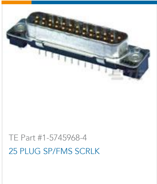
TE Part #1-5745968-4 25 PLUG SP/FMS SCRLK