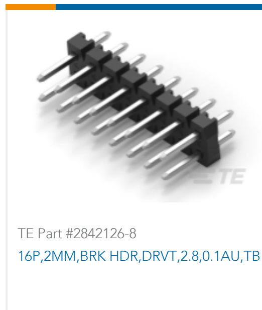
TE Part #2842126-8 16P,2MM,BRK HDR,DRVT,2.8,0.1AU,TB /MT