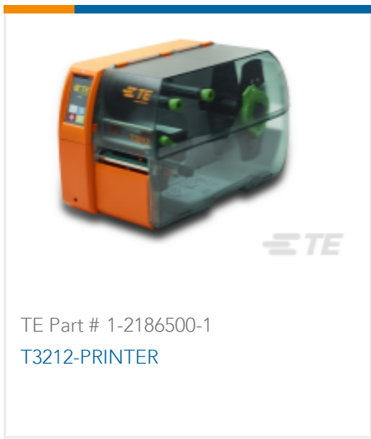
TE Part # 1-2186500-1 T3212-PRINTER