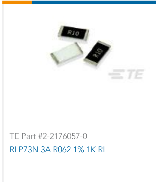
TE Part #2-2176057-0 RLP73N 3A R062 1% 1K RL