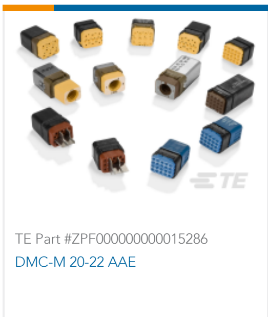
TE Part #ZPF00000000015286 DMC-M 20-22 AAE