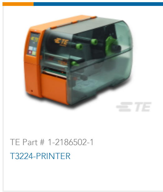
TE Part # 1-2186502-1 T3224-PRINTER