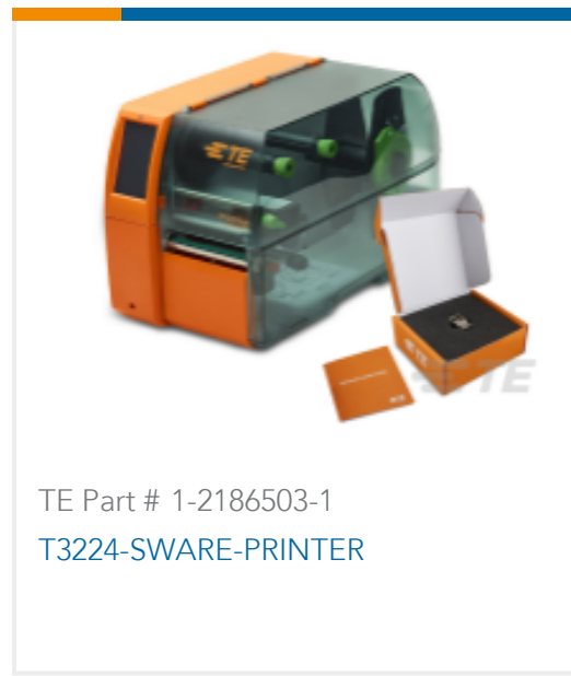
TE Part # 1-2186503-1 T3224-SWARE-PRINTER