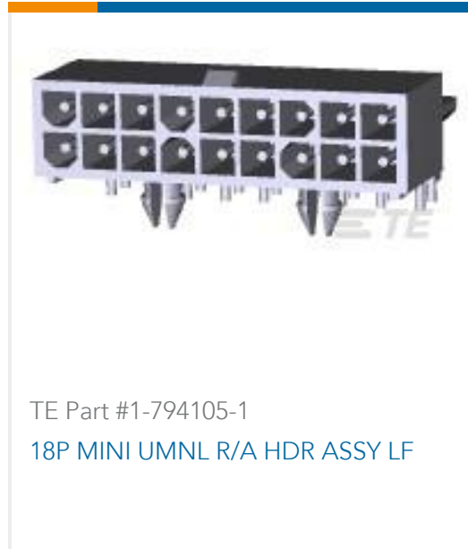
TE Part #1-794105-1 18P MINI UMNL R/A HDR ASSY LF