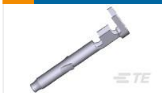
TE Part #170362-1 UNIV M-N-L SOC. 22-18 AWG