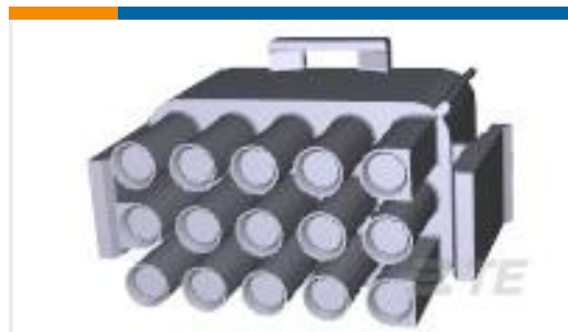
TE Part #1-350736-9 15P UMNL V0 PLUG HSG BLACK