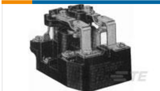
TE Part #1393127-9 PRD-11AG0-120=PRD