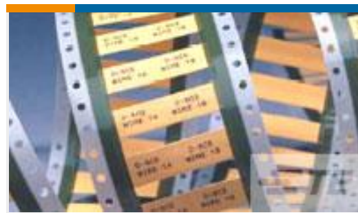
TE Part #129501-000 D-SCE-1K-38-50-S1-4