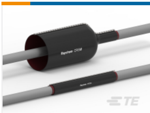
TE Part #204633-000 CRSM-53/13-1200/239(S5)