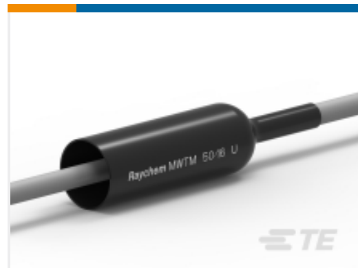
TE Part #596462-000 Medium-Wall Heat Shrink Tubing