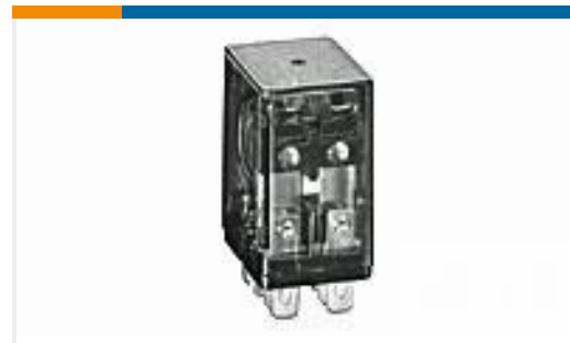
TE Part #6-1393144-8 K10P-11D55-24=K10/K20