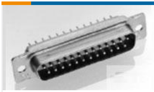
TE Part #205162-1 AMPLIMITE,ASY,PLUG,STD,109,1