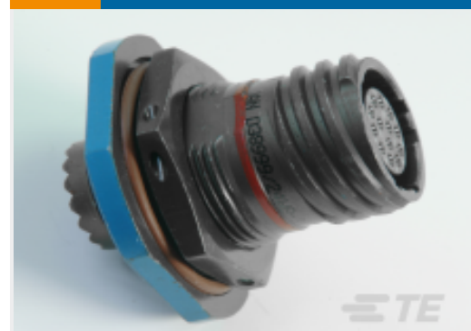
TE Part #YDTS24W2544420PA04 RECEPT.JAM NUT. 4 X #4. 4 X #20.