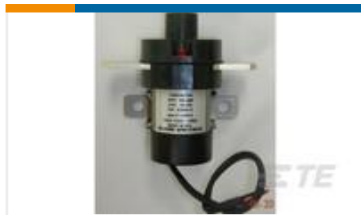
TE Part #2-1616980-5 K200A1C1=CONTACTOR 200 AMP SPST 28 VDC