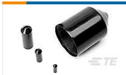
TE Part #A70118-000 101A041-100/180-0