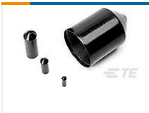
TE Part #383008-3 SSC-3/239