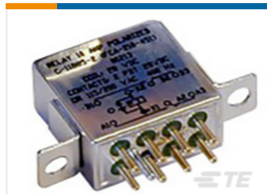
TE Part #3-1617784-0 FCA-210-1015L=M83536 /10-015L