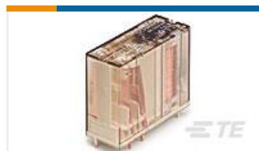
TE Part #1-1415012-1 V23047-A1110-A501