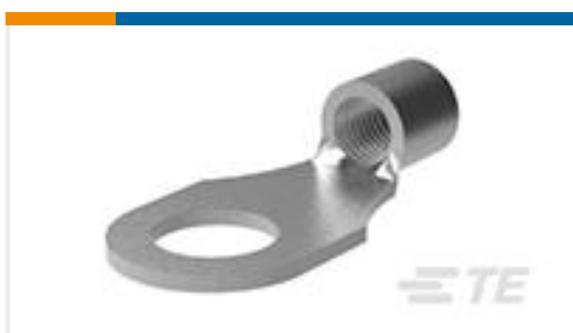
TE Part #2-36932-2 TERMINAL,SOLIS R 4/0 1/4