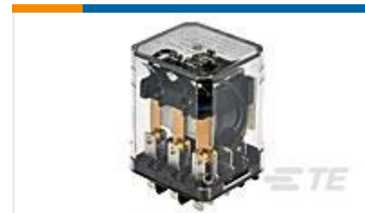
TE Part #3-1393118-1 KUP-14D45-110=KU