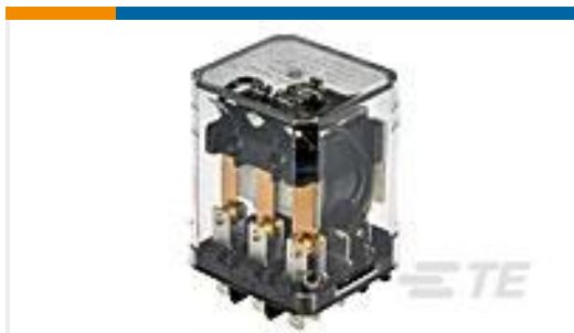
TE Part #2-1393118-6 KUP-14D35-110=KU