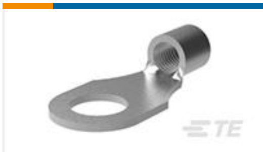
TE Part #2-36932-2 TERMINAL,SOLIS R 4/0 1/4