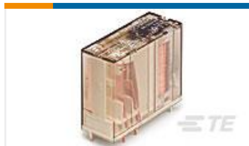
TE Part #1-1415012-1 V23047-A1110-A501