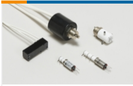
High Voltage Relays(38)