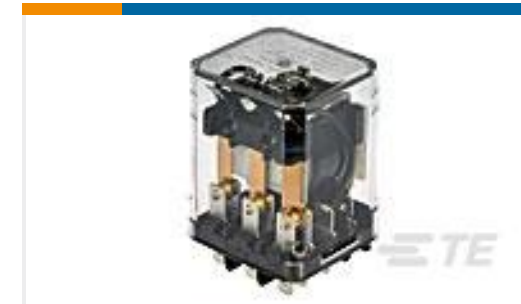
TE Part #3-1393118-1 KUP-14D45-110=KU