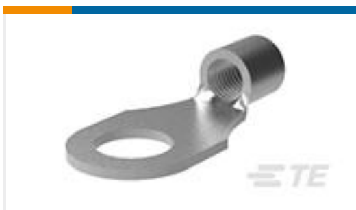
TE Part #2-36932-2 TERMINAL,SOLIS R 4/0 1/4