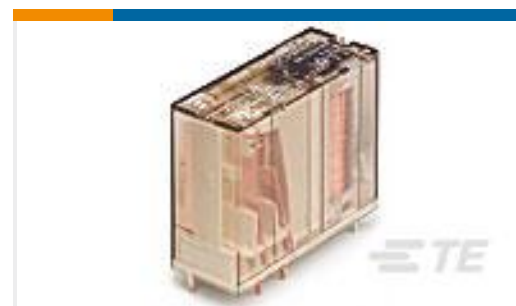
TE Part #1-1415012-1 V23047-A1110-A501