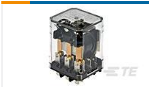
TE Part #2-1393118-6 KUP-14D35-110=KU