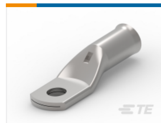
TE Part #710977-1 XCT 4-4