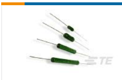
TE Part #1623774-1 C14 180R 2% (LOOSE)