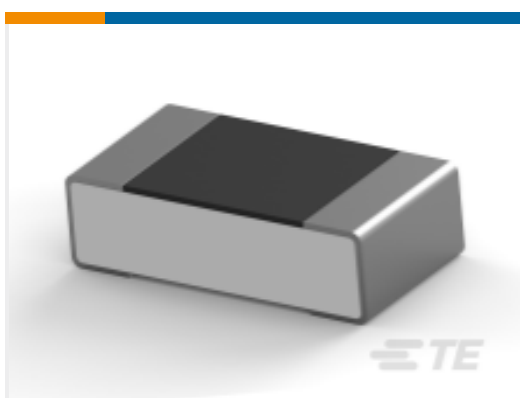
TE Part #8-2176370-8 RQ 0603 3K48 0.1% 10PPM 5K RL