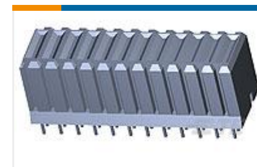
TE Part #120992-9 UPM EXPANDED RCPT ASSEMBLY