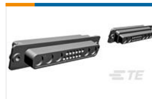
TE Part #445726-1 RECEPT ASSY,21C4, AMPLIMITE