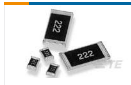
TE Part #1623430-1 CRG1206 1% 160K