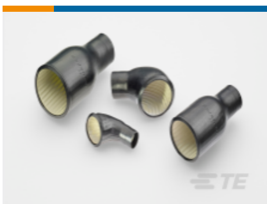
TE Part #EM1020-000 214A021-25C-0