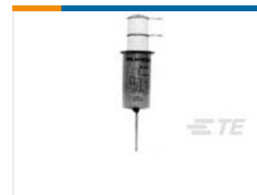
TE Part #1-1618239-6 K41A234=RELAY, VACUUM, SPST-NO