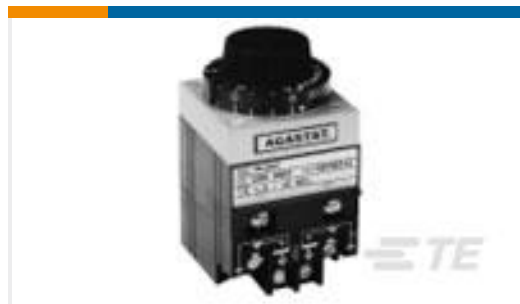
TE Part #2-1423159-2 7012PBX=RLY,STD,ON,2P, 125VDC,