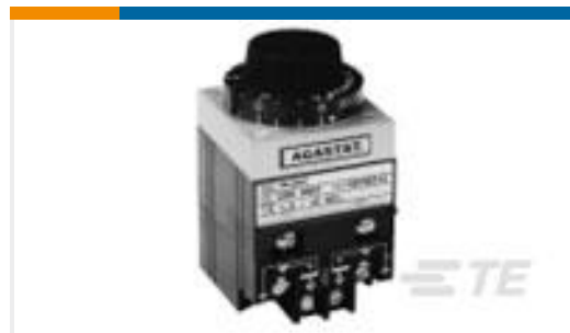
TE Part #1423179-2 7032PBB=RLY,STD,DBH, 2P,125VDC,