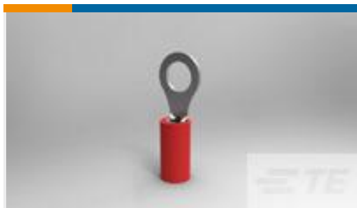
TE Part #171506-2 PIDG RING (22-18)