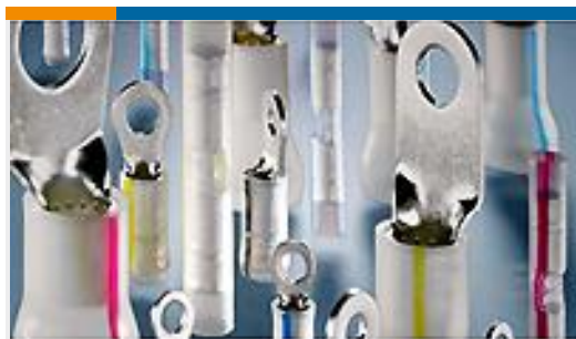
TE Part #53982-1 TERMINAL,PIDG PVF2 R 16-14HD