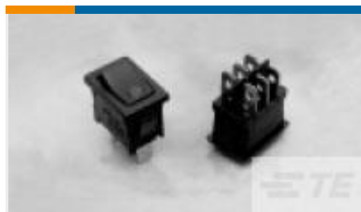
TE Part #1571091-3 PRBSA1-16F- BBOCW=POWER ROCKER