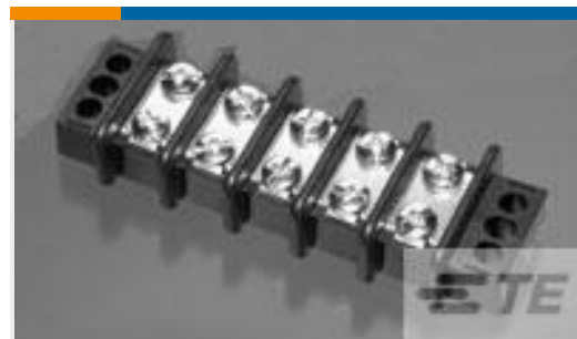
TE Part #1-1546311-0 10P.563" DR BARRIER,W /WASHER