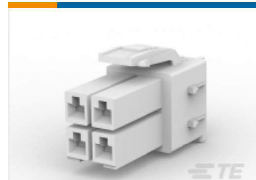
TE Part #5-177900-1 POWER DBL LOCK PLUG HSG 4P(GWT)