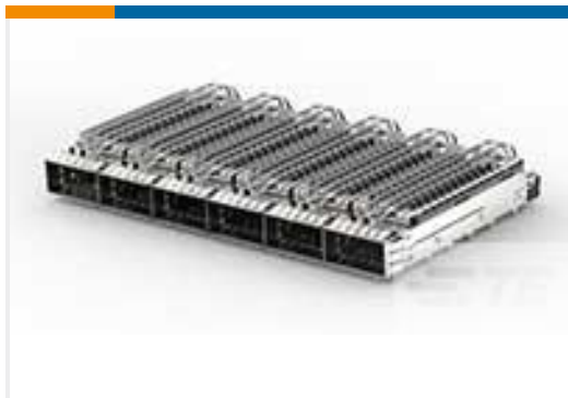
TE Part #2-2170708-1 CAGE ASSY, 1X6, QSFP28, SPRING, HS, LP