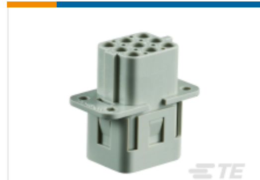
TE Part #T2019092201-000 HQ-008-F