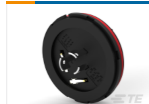
TE Part #1-2336396-1 ASSEMBLY, LIGHT CONTROLLER BASE, W /VENT