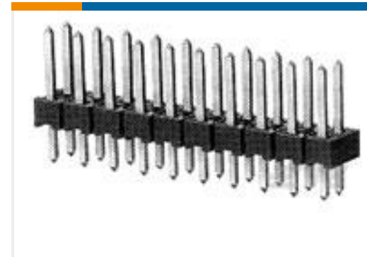
TE Part #1-146261-5 30 MODII HDR DRST B/A . 100CL