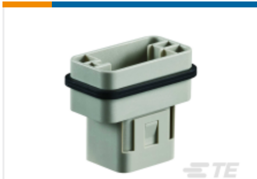
TE Part #T2019092101-000 HQ-008-M