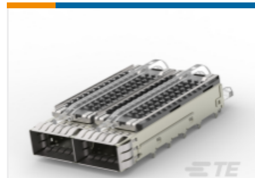
TE Part #2170808-1 QSFP28, 1X2, CAGE ASSY, SPRING, HS, LP