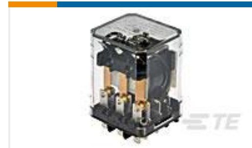
TE Part #3-1393118-1 KUP-14D45-110=KU