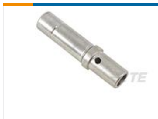
TE Part #0462-203-12141 SOC, SOLID, SIZE 12, 12-14AWG, NI