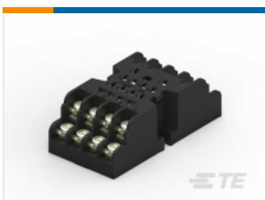
TE Part #1-1393143-9 27E166=SOCKET,KH,14,SCW,PLES