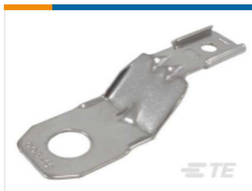
TE Part #1027-003-1200 CLIP, SS, 11MM HOLE, ST