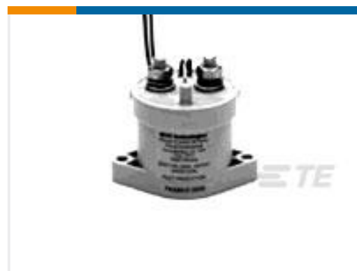
TE Part #1618002-7 EV200AAANA=RELAY, EV200 SPST-N