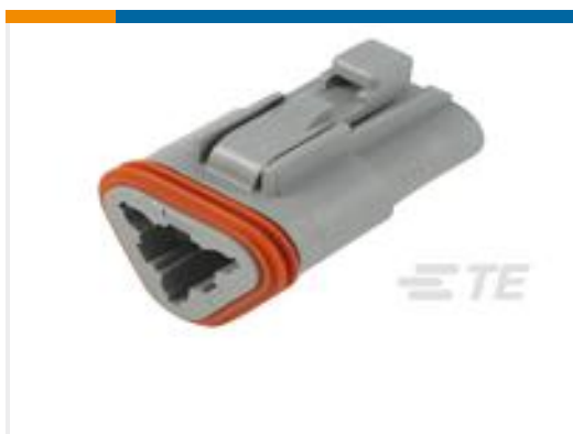
TE Part #DT06-3S PLG, 3P, GRY, N