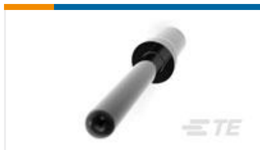
TE Part #1766193-1 CONTACT,PIN,SIZE #12