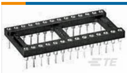
TE Part #1-1437539-4 814-AG10D-ES=SOCKET ASSY