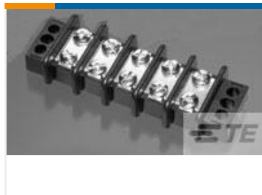
TE Part #1546671-3 3P .437" DR BARRIER,W/WIR CLMP