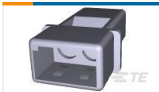
TE Part #170924-1 MNL 2 POS NATURAL PIN HSG