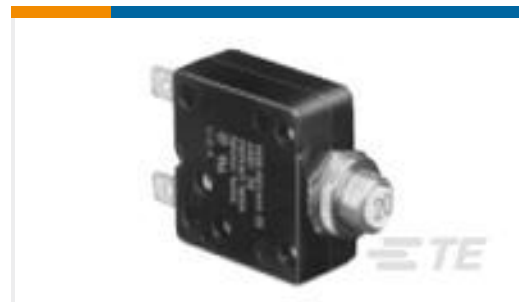
TE Part #1393249-9 W58-XB1A4A-15=W58