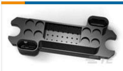
TE Part #1648203-1 297-08-01100=SA CONN,PIN