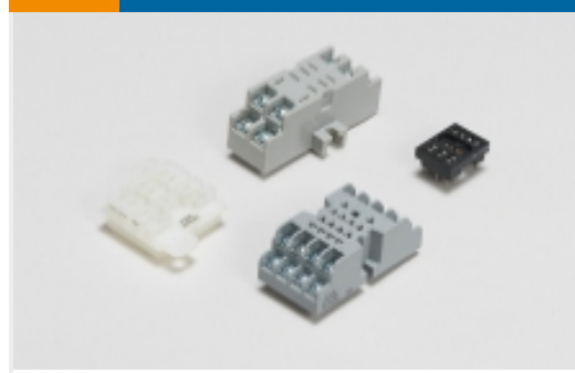
Relay Accessories, Sockets & Clips(5)