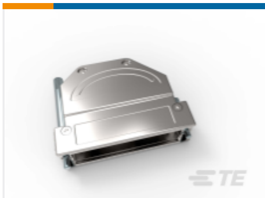
TE Part #1-2308346-7 FULL METAL HOODS SIZE 5 - 7 (RAW)