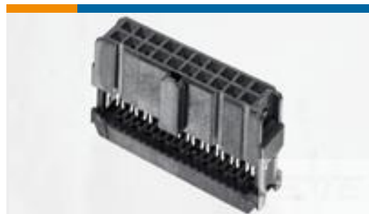
TE Part #1658622-4 20 NOVO MIL/CTR 30DP,LEAD FREE