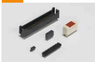
Board-to-Board Headers & Receptacles (130)