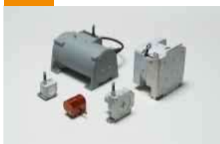
Cable Actuated Position Sensors (17)