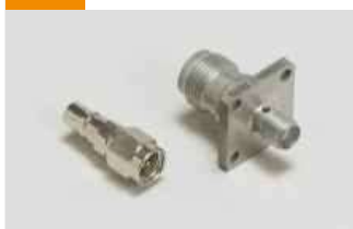
Between Series Adapters (1)