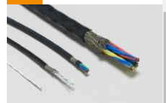
Multicore Cable (528)