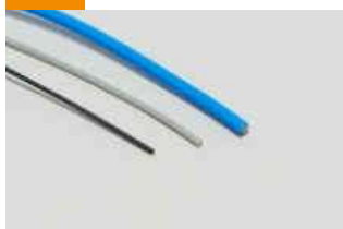
Hook Up Wire (878)