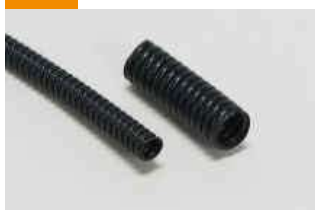
Convoluted Tubing (15)