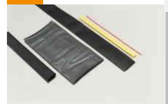
Heat Shrink Tubing (148)