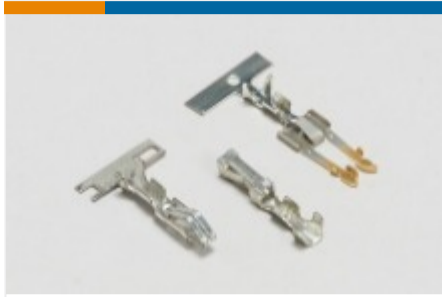
Board-to-Board Connector Contacts (2)