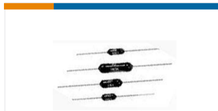
TE Part # H4P910RFZA H4P 910R 1% 100PPM