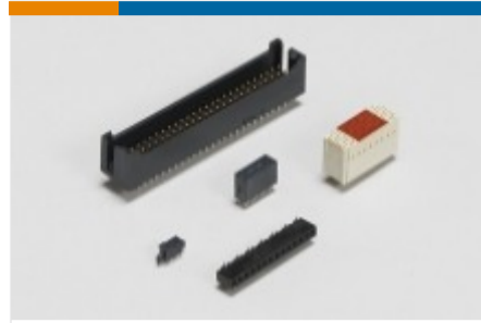
Board-to-Board Headers & Receptacles (1)