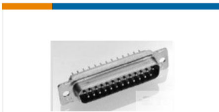
TE Part # 1-1757819-0 AMPLIMITE, ASY, PLUG, STD, 109, ZN, 5, CT