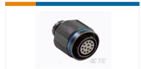
TE Part # ACT26MD05SN [V001] STRAIGHT PLUG