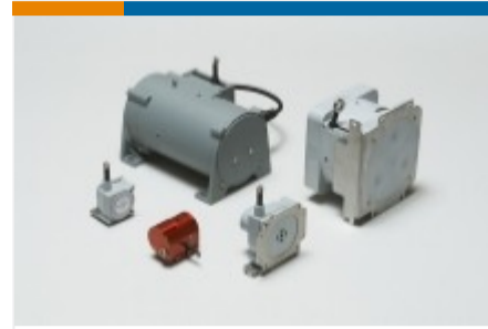
Cable Actuated Position Sensors (17)