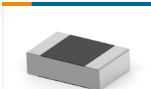
TE Part #2176264-9 RN 0805 619K 0.1% 10PPM 1K RL