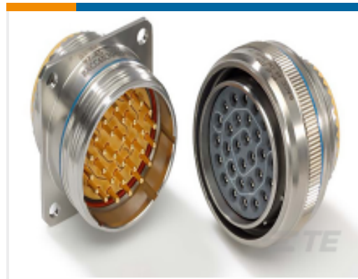
TE Part #ZPF000000000008156 983-6K 20-41 S7 L