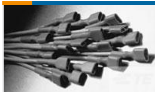
TE Part #4126314001 LSTT-12.7-6-SP