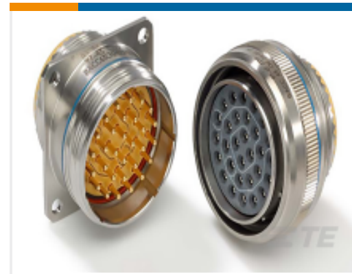
TE Part #ZPF000000000008564 983-6S 10-06 S8