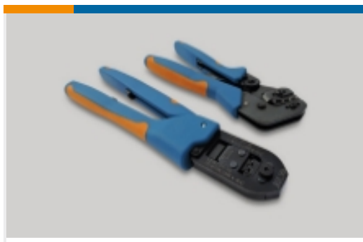
Portable Crimp Tools(1)