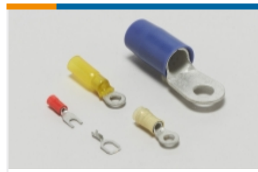
Rings & Spades(868)