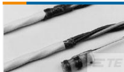
TE Part #163665N003 S02-07-RCS453