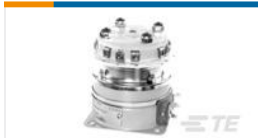
TE Part #1393139-7 MDR-135-1=MDR