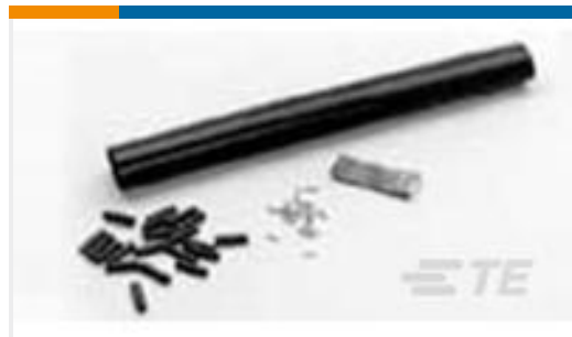
TE Part #453757-000 LNCL-15-185-GK