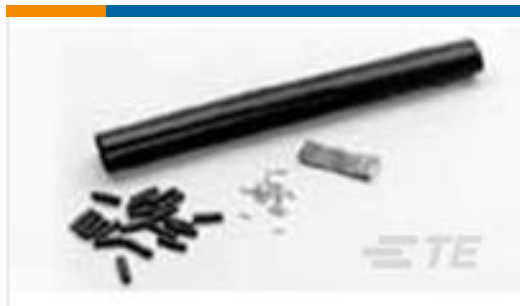
TE Part #348579-000 LNCL-14-355-GK