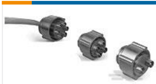
TE Part #861648-9 HV PIN PLUG ASY