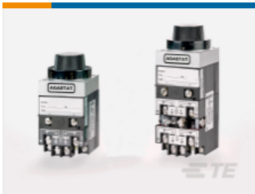
TE Part #1423158-3 7012L10DLN=AGASTAT TIMING RELA