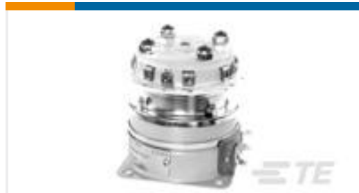
TE Part #1393139-9 MDR-136-1=MDR