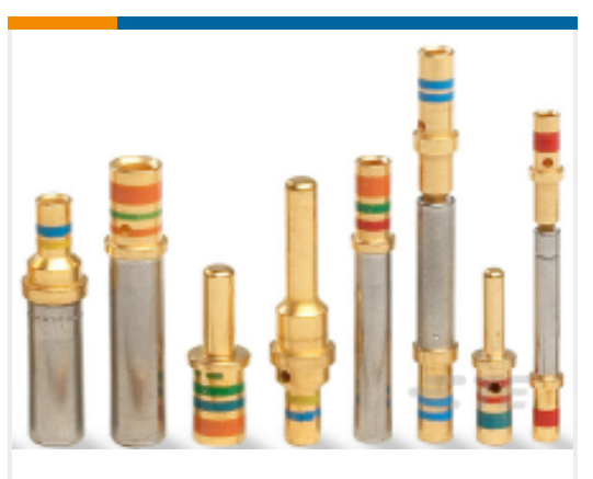
TE Part #38943-22L CONT SOC ASSY