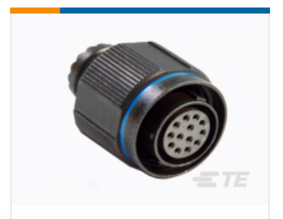
TE Part #DTS26W15-35SN PLUG ASSY