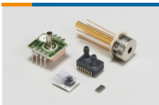
Board Level Pressure Sensors(3)