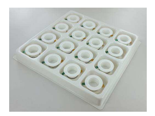
Individual Packaging on Spools