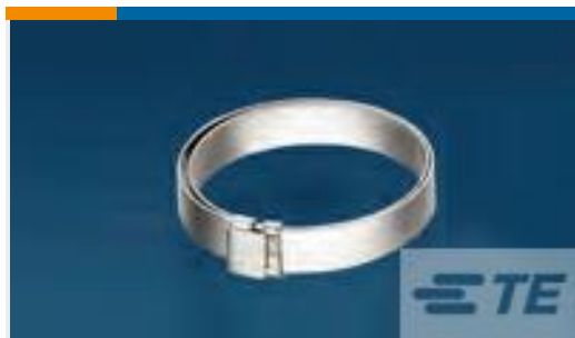
TE Part # CW2823-000 R85049/128-3