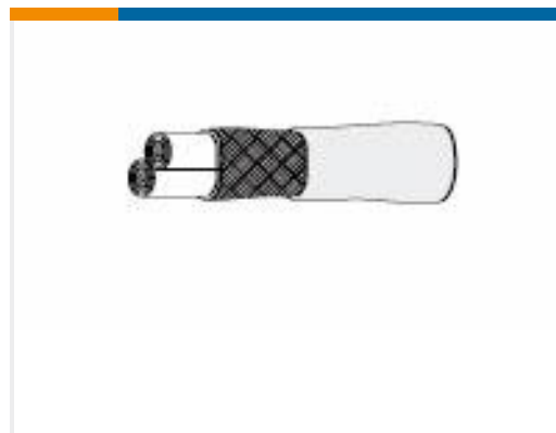
TE Part #272103-000 55A1123-20-9/96-9CS2275