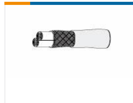
TE Part #812455-000 55A1123-22-9/96-9CS2275