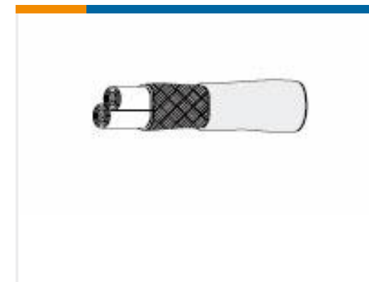
TE Part #812455-000 55A1123-22-9/96-9CS2275