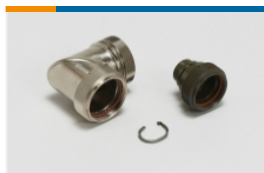
Screened Backshells & Adapters(137)