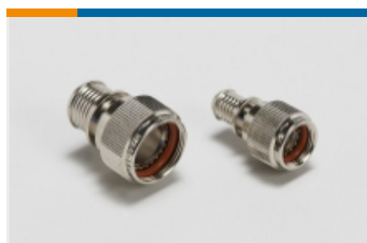
Unscreened Backshells & Adapters (267)